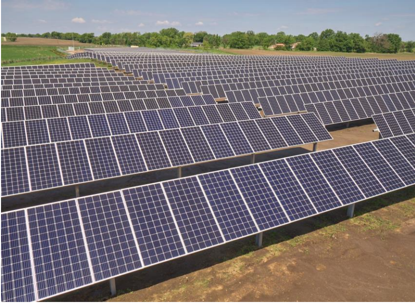
Minnesota Municipal Power Agency's 7 MW Buffalo Solar Buffalo, MN